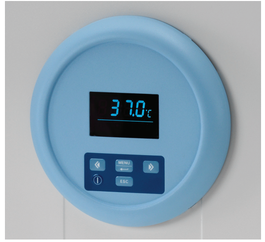
Simple temperature setting with intuitive user interface