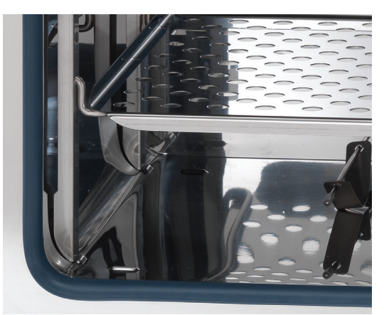
Easy cleaning with smooth, stainless steel interior and rounded corners