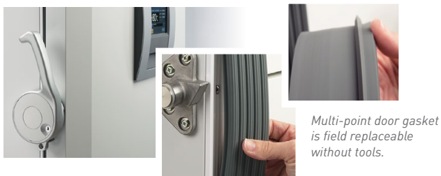
Multi-point door gasket is field replaceable without tools.

New Panasonic Healthcare VIP ECO ultra-low temperature freezers with natural refrigerants now deliver more energy efficient and dependable ultra-low temperature storage with forward performing cooling systems. Our freezers are designed, tested and field-proven for safe, reliable storage of biologicals.