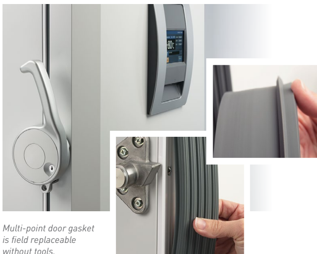
Multi-point door gasket is field replaceable without tools.

New Panasonic Healthcare VIP ECO ultra-low temperature freezers with natural refrigerants now deliver more energy efficient and dependable ultra-low temperature storage with forward performing cooling systems. Our freezers are designed, tested and field-proven for safe, reliable storage of biologicals.