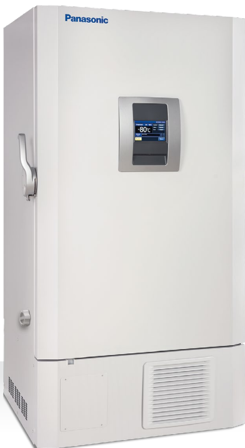
Model MDF-DU702VH-PA 76020-716