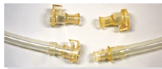
MediaBox Quick Connectors